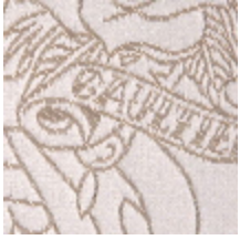
3440-01 SKIN - BEIGE