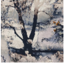
3441-01 VAGABOND - TERRE *