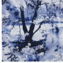
3441-03 VAGABOND - ENCRE *