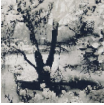
3441-02 VAGABOND - GRAPHITE *