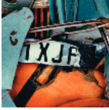
3442-02 FANGIO - PETROLE *