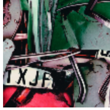
3442-03 FANGIO - SANGUINE