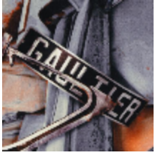
3442-01 FANGIO - TERRE