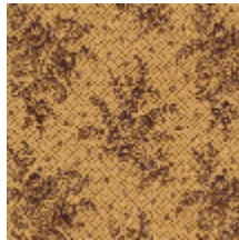
3447-05 CASINO - TERRE *