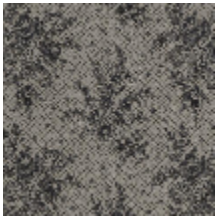
3447-02 CASINO - TAUPE