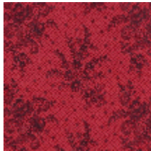
3447-03 CASINO - ROUGE