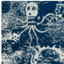
3455-02 STREET - INDIGO *