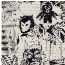
3455-01 STREET - GRAPHITE