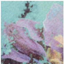
3459-01 BOTANIQUE - BLEUET