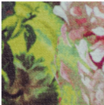
3459-02 BOTANIQUE - POLLEN