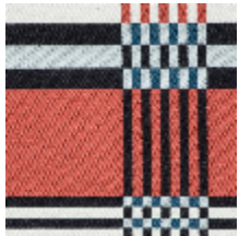
3461-01 ST JEAN DE LUZ - PETROLE