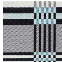
3461-05 ST JEAN DE LUZ - CIEL