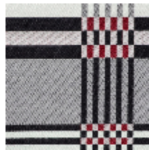
3461-04 ST JEAN DE LUZ - LAQUE