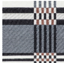
3461-03 ST JEAN DE LUZ - CHATAIGNE *