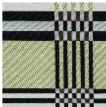
3461-02 ST JEAN DE LUZ - POLLEN *