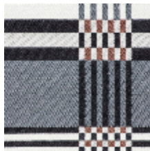
3461-03 ST JEAN DE LUZ - CHATAIGNE *