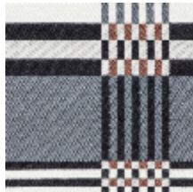
3461-03 ST JEAN DE LUZ - CHATAIGNE *