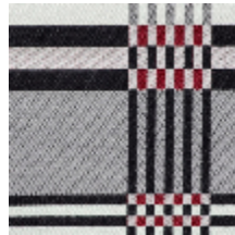
3461-04 ST JEAN DE LUZ - LAQUE *