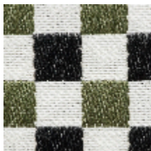
3462-09 BIARRITZ - KAKI *