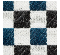
3462-07 BIARRITZ - PETROLE *