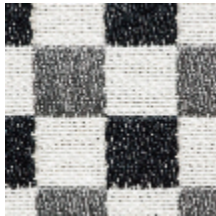
3462-02 BIARRITZ - ANTHRACITE *