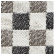
3462-01 BIARRITZ - TAUPE *