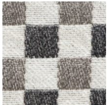
3462-01 BIARRITZ - TAUPE *