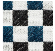
3462-07 BIARRITZ - PETROLE *