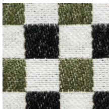
3462-09 BIARRITZ - KAKI *