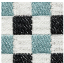
3462-08 BIARRITZ - CIEL *