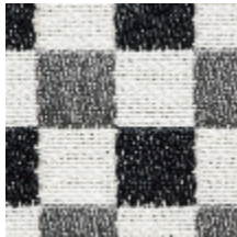
3462-02 BIARRITZ - ANTHRACITE *