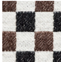
3462-04 BIARRITZ - BRUN *