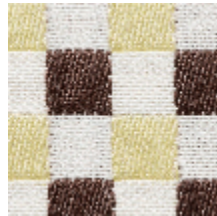
3462-03 BIARRITZ - POLLEN *