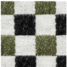
3462-09 BIARRITZ - KAKI *