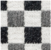
3462-02 BIARRITZ - ANTHRACITE *