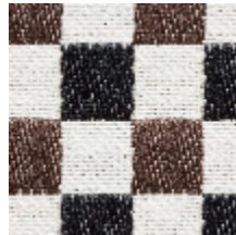
3462-04 BIARRITZ - BRUN *