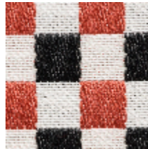
3462-06 BIARRITZ - CORAIL *