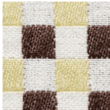
3462-03 BIARRITZ - POLLEN *