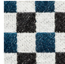
3462-07 BIARRITZ - PETROLE *