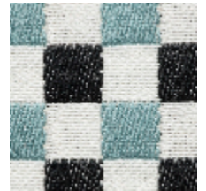
3462-08 BIARRITZ - CIEL *