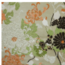
3466-01 KYOTO - TAUPE