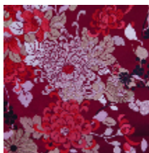
3466-02 KYOTO - GRENAT