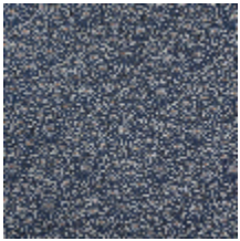
3467-08 OBI - MARINE