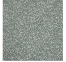
3467-07 OBI - CIEL