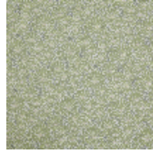
3467-05 OBI - AMANDE