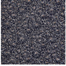
3467-01 OBI - NOIR