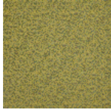
3467-03 OBI - DORE