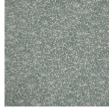
3467-07 OBI - CIEL