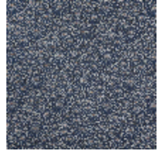
3467-08 OBI - MARINE