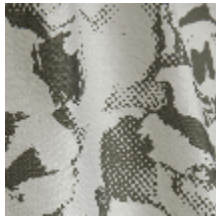
3470-02 PIVONKA - ANTHRACITE