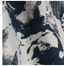
3470-04 PIVONKA - MARINE