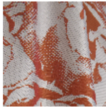
3470-03 PIVONKA - ORANGE