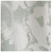
3470-01 PIVONKA - AMANDE