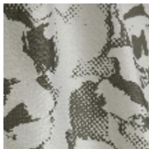
3470-02 PIVONKA - ANTHRACITE