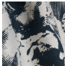
3470-04 PIVONKA - MARINE