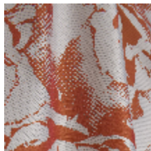
3470-03 PIVONKA - ORANGE