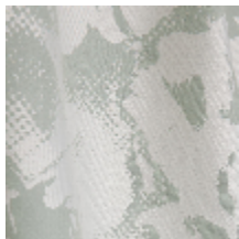
3470-01 PIVONKA - AMANDE