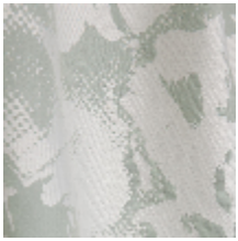
3470-01 PIVONKA - AMANDE