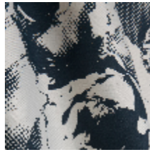
3470-04 PIVONKA - MARINE