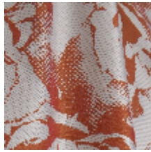
3470-03 PIVONKA - ORANGE