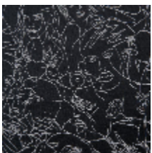
3471-01 REGARD - NOIR