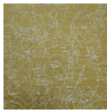
3471-04 REGARD - OR