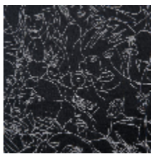
3471-01 REGARD - NOIR