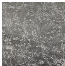
3471-03 REGARD - GRIS