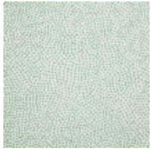
3473-07 ESCALE - CELADON