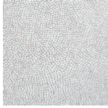
3473-03 ESCALE - BEIGE