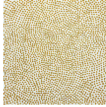
3473-04 ESCALE - DORE