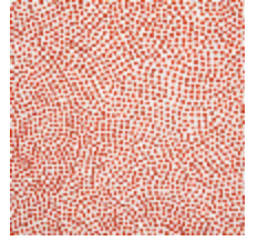
3473-06 ESCALE - BRIQUE