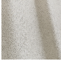
3473-02 ESCALE - NATUREL