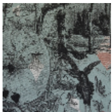
3489-02 TAROT - CELADON *