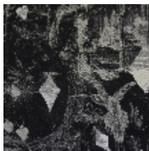
3489-03 TAROT - NOIR *