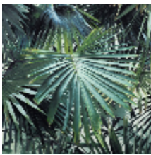
3490-02 LES MARQUISES - EMERAUDE