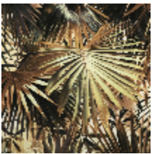
3490-01 LES MARQUISES - MORDORE