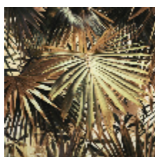
3490-01 LES MARQUISES - MORDORE