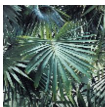
3490-02 LES MARQUISES - EMERAUDE