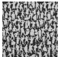
3492-06 SILHOUETTES - NOIR