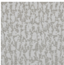
3492-01 SILHOUETTES - NATUREL