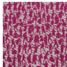
3492-05 SILHOUETTES - FUCHSIA