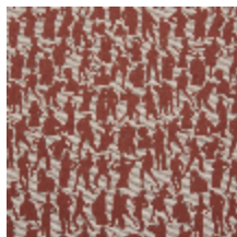
3492-03 SILHOUETTES - TERRACOTTA