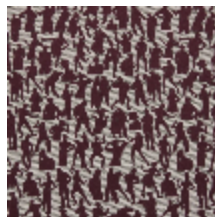
3492-04 SILHOUETTES - BORDEAUX