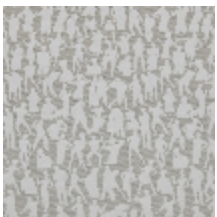
3492-01 SILHOUETTES - NATUREL