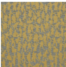
3492-02 SILHOUETTES - JAUNE