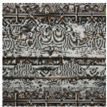
3493-01 STRIPE - CUIVRE