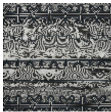
3493-03 STRIPE - PETROLE