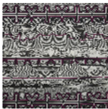
3493-02 STRIPE - FUCHSIA