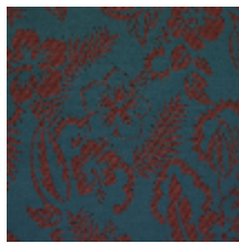
3495-03 NOOREA - CANARD