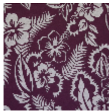
3495-04 NOOREA - FUCHSIA