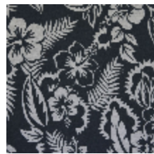
3495-05 NOOREA - PETROLE