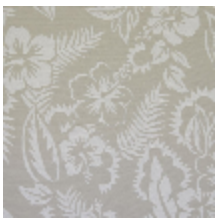
3495-01 NOOREA - NATUREL