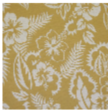
3495-02 NOOREA - JAUNE