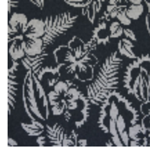
3495-05 NOOREA - PETROLE *