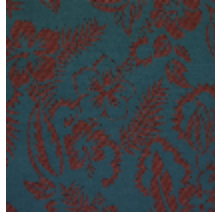
3495-03 NOOREA - CANARD *