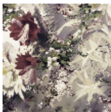
3497-01 FLOWER POWER - PASTEL