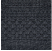
3614-01 PATCHWORK - FUSAIN