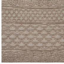
3614-02 PATCHWORK - TAUPE