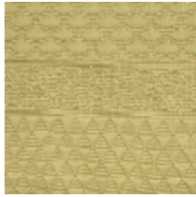
3614-08 PATCHWORK - LIMONCELLO