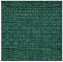
3614-07 PATCHWORK - PAON