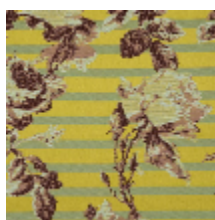
3615-02 CROISIÈRE - BERGAMOTE