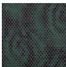
3619-02 TROIS D - ACQUA/PRUNE