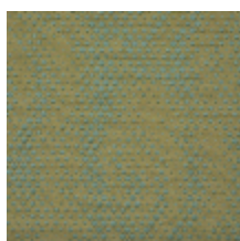
3619-01 TROIS D - BERGAMOTTE