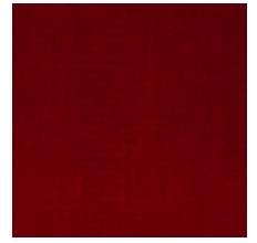
0381-09 MAESTRO- THEATRE