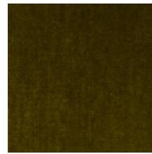
0381-20 MAESTRO- BRONZE