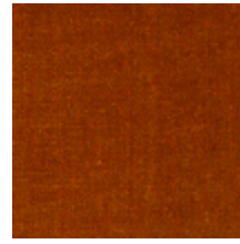
0381-08 MAESTRO- CORNALINE