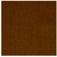
0381-01 MAESTRO- MORDORE