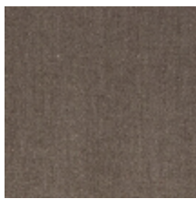
0381-23 MAESTRO- PLATINE