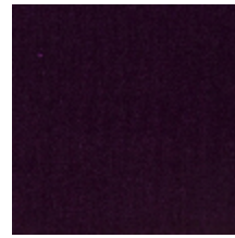
0381-14 MAESTRO- CASSIS