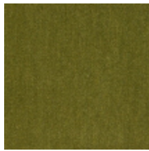
0381-18 MAESTRO- AMANDE