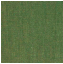
0381-17 MAESTRO- WATTEAU