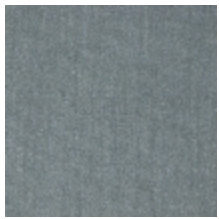
0381-16 MAESTRO-CIEL *