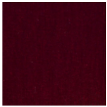
0381-10 MAESTRO- GRENAT