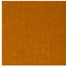
0381-05 MAESTRO- CHAMOIS