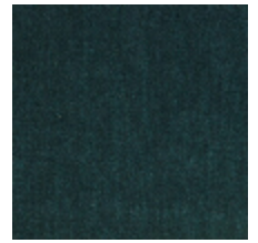
0381-15 MAESTRO- NATTIER