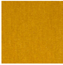
0381-02 MAESTRO-VIEIL OR