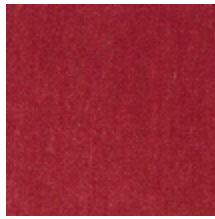
0381-12 MAESTRO-VIEUX ROSE