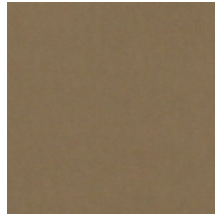
0383-10 COSMOS - CHATAIN