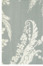
4003-03 LAMPAS CHENIER-BLEU RAC.140