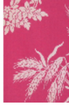
4003-04 LAMPAS CHENIER-ROUGE R.140