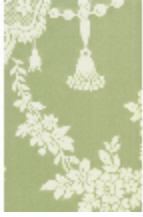
4003-02 LAMPAS CHENIER-VERT RAC.140