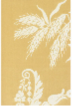
4003-01 LAMPAS CHENIER-OR RAC.140