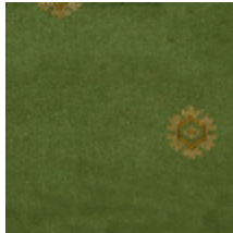
4009-02 FAUTEUIL MASSENA - VERT