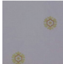
4009-04 FAUTEUIL MASSENA - BLANC