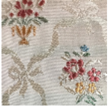
4017-01 LAMPAS ROMANCE - CREME