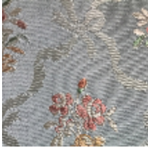
4017-04 LAMPAS ROMANCE - BLEU