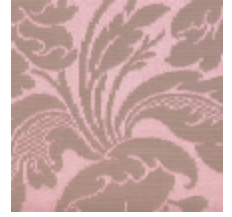
4019-14 DAMAS ALCANTE - ROSE/OLIVE