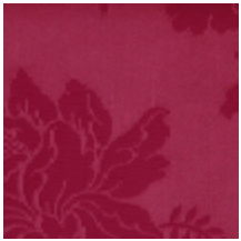
4019-15 DAMAS ALCANTE - ROUGE