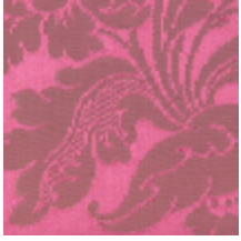
4019-01 DAMAS ALCANTE - FRAISE/BIS