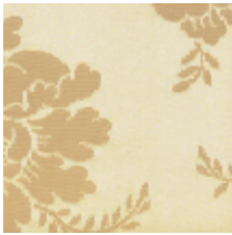
4019-17 DAMAS ALCANTE - ECUME