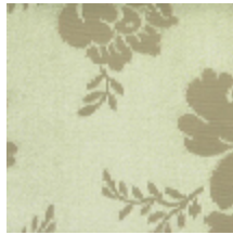
4019-22 DAMAS ALCANTE - VERT/BIS