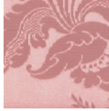
4019-10 DAMAS ALCANTE - ROSE