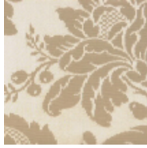
4019-09 DAMAS ALCANTE - BLANC