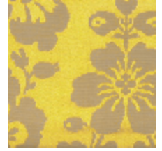
4021-22 DAMAS RECTA - VIEIL OR/BIS