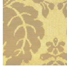
4021-21 DAMAS RECTA - PAILLE