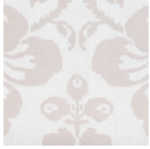
4021-11 DAMAS RECTA - IVOIRE