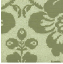
4021-15 DAMAS RECTA - SALADE