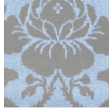
4021-20 DAMAS RECTA - NATTIER/BIS