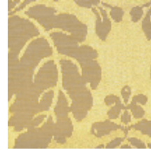
4021-21 DAMAS RECTA - PAILLE