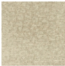
4031-02 FAUVE - ECRU