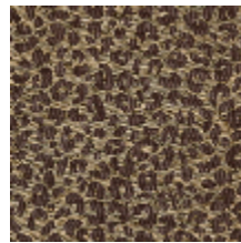
4031-05 FAUVE - BRUN