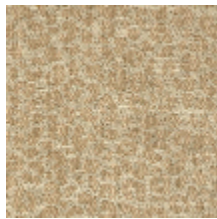
4031-03 FAUVE - BEIGE