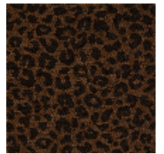
4031-06 FAUVE - CAMEL