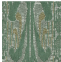
4032-04 SCULPTURE - CELADON