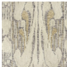
4032-03 SCULPTURE - GALET