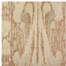
4032-02 SCULPTURE - ROUX