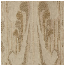
4032-01 SCULPTURE - NATUREL