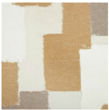
4033-01 ABSTRACT - BLANC SABLE